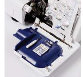
Built-in accessory storage