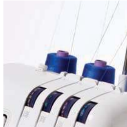
4 colour easy threading guide