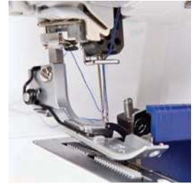
Automatic needle threader